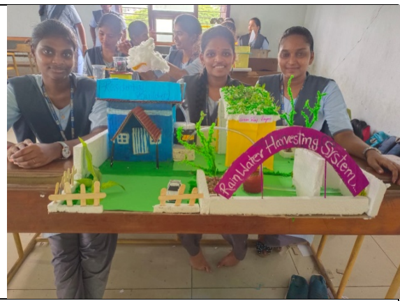
Project expo of II Years